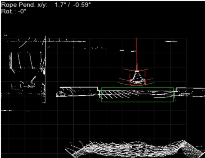
Grab 3D live tracking, hatch and bulk material scan

Whereas the 3D scanner is the “eye” of the automation system, a high-performance evaluation unit is mounted on the crane and connected with the PLC – the “brain”.